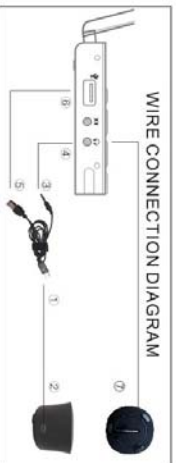
WIRE CONNECTION DIAGRAM